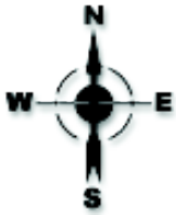
Sketch Floor Plan